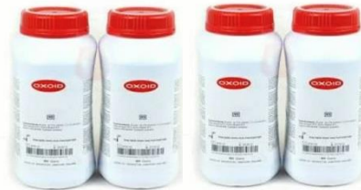
PCA, BPA, EMBA, XLDA